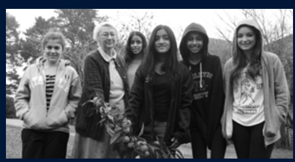
Our first Hartzer program in 2013

The school experience has always been a combination of academic learning, co-curricular opportunities and the development of values and practices to equip young people for life. In recent years, this has been described with the umbrella term 'educating the whole person' and it is an approach that was central to the establishment of our Hartzer program in 2013.