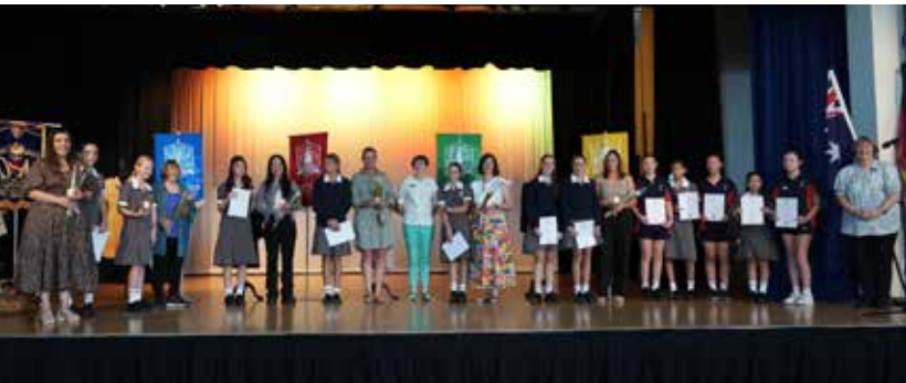
Celebrating our OLSH Generations; Our Student Leaders attended the International Women's Day breakfast at Parliament House