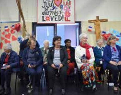
Singing Si Si Ni Moja for the OLSH Sisters at our Feast day mass