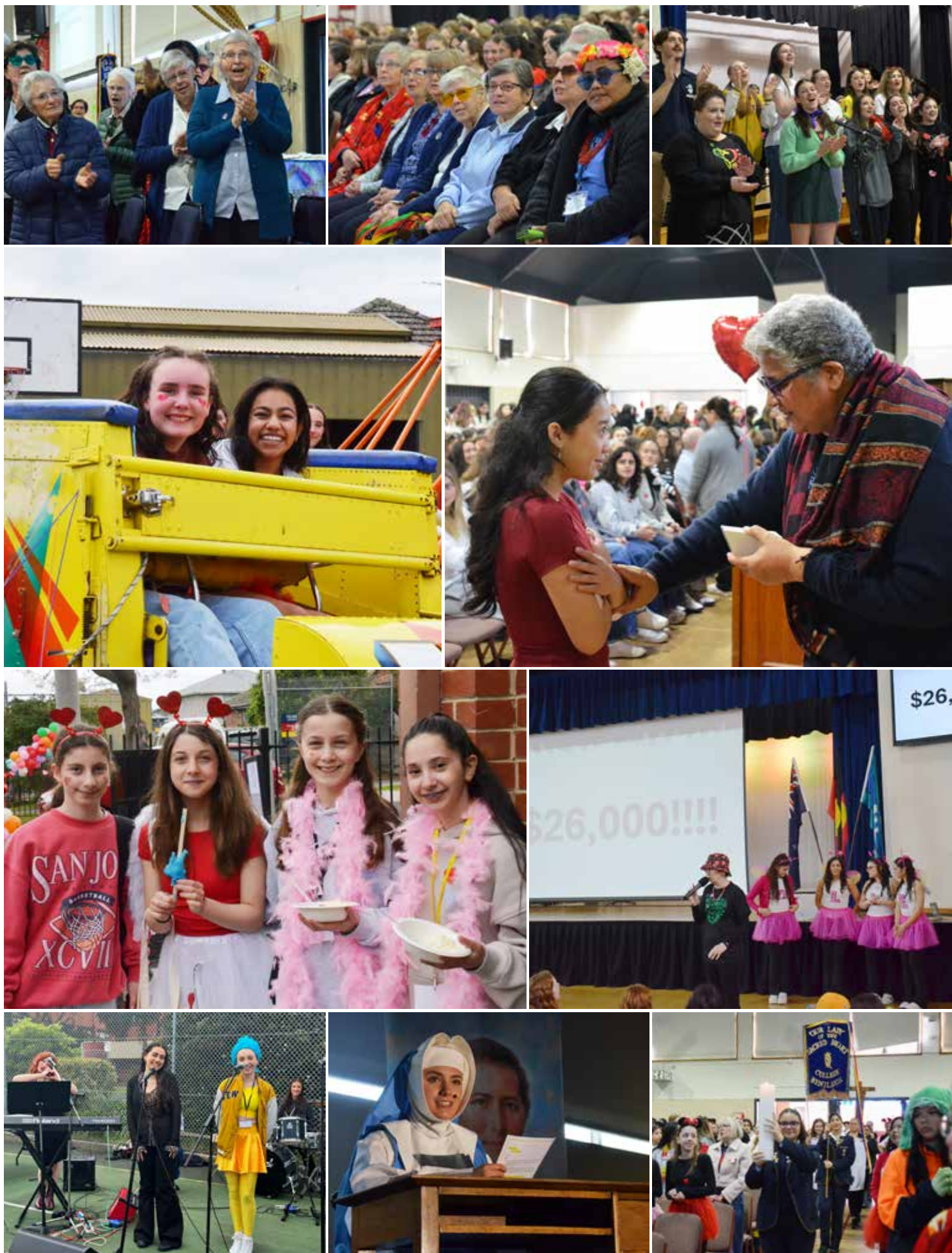
Our special Feast Day mass attended by 16 OLSH Sisters; our gift of song to the OLSH Sisters; Hearts were everywhere on Feast Day; our record-breaking fundraising for the OLSH Sisters overseas projects