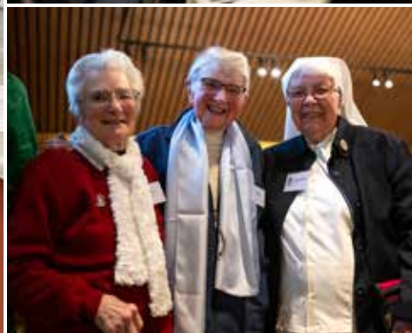
A wonderful evening celebrating 150 years of the OLSH Sisters