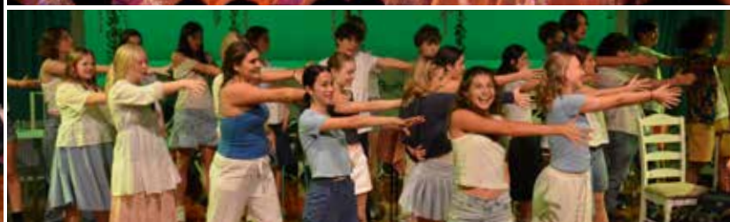
Highlights from our production of Mamma Mia!