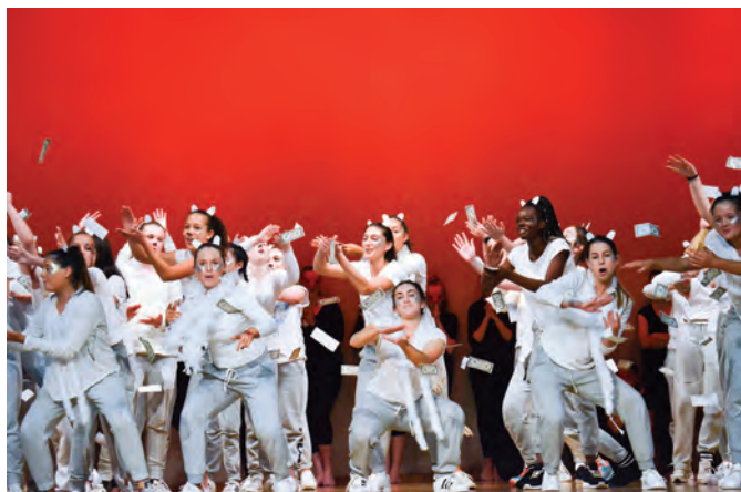
Hartzler House was declared the 2017 Performing Arts Spectacular winner