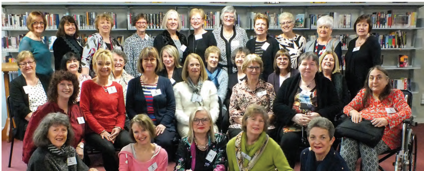
Class of 1967, 50 year reunion