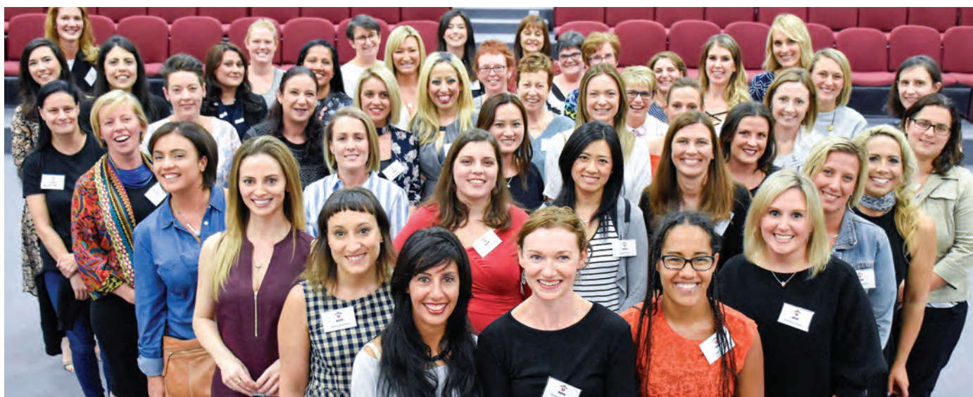
Class of 1997, 20 year reunion