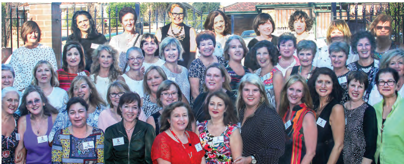
Class of 1977, 40 year reunion