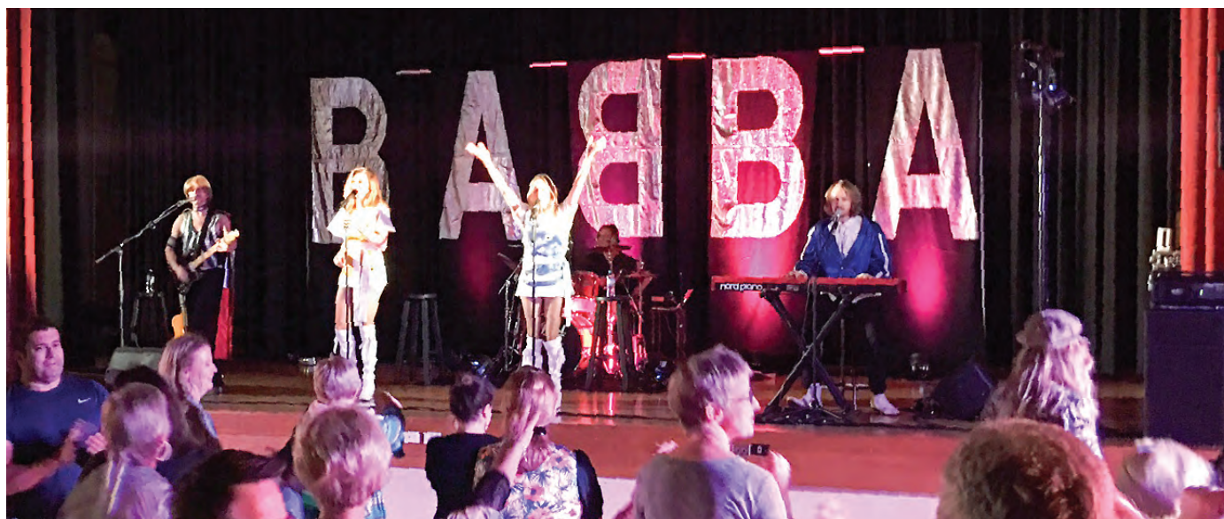
BABBA parent evening

Sincere thanks also go to the busy parents who are members of the OLSH College Parents and Friends Association, the time and effort they devote to helping the College is very much appreciated.