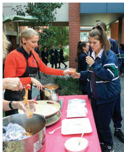
Four Nonna's pasta offer sampling

The P&F has also been busy on the fundraising front with a Hot Cross Bun Drive and a Mother's Day offer